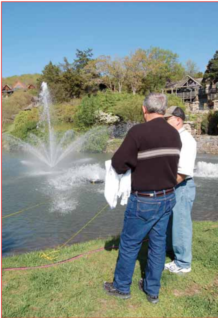
Different fountains serve different purposes. Some are designed to move water, all are designed for beauty and esthetic appeal.

Want to feed your fish? There are a variety of different automatic, battery-operated feeders on today's mar-